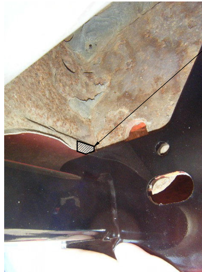
LIP TRIM DIAGRAM