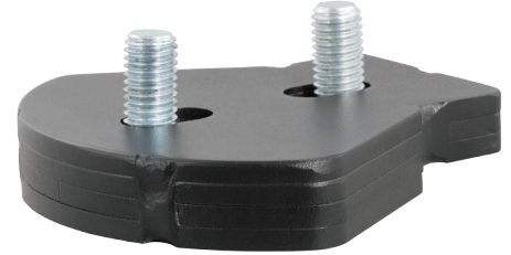
16992 fits A-series 5th wheel hitches