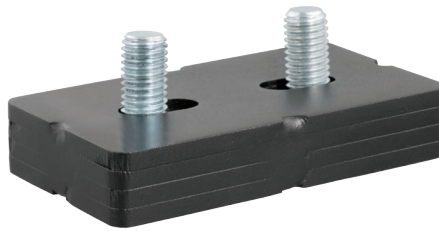
16991 fits E-series 5th wheel hitch