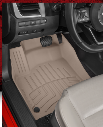
FRONT & REAR FLOORLINER™ HP