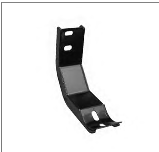
(Fig 1) Driver/left Mounting Bracket

8mm Flat Washers 8mm Lock Washers 8mm Hex Nuts