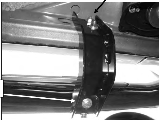
(Fig 2) Driver/left front Bracket pictured

8mm Flat Washers 8mm Lock Washers 8mm Hex Nuts