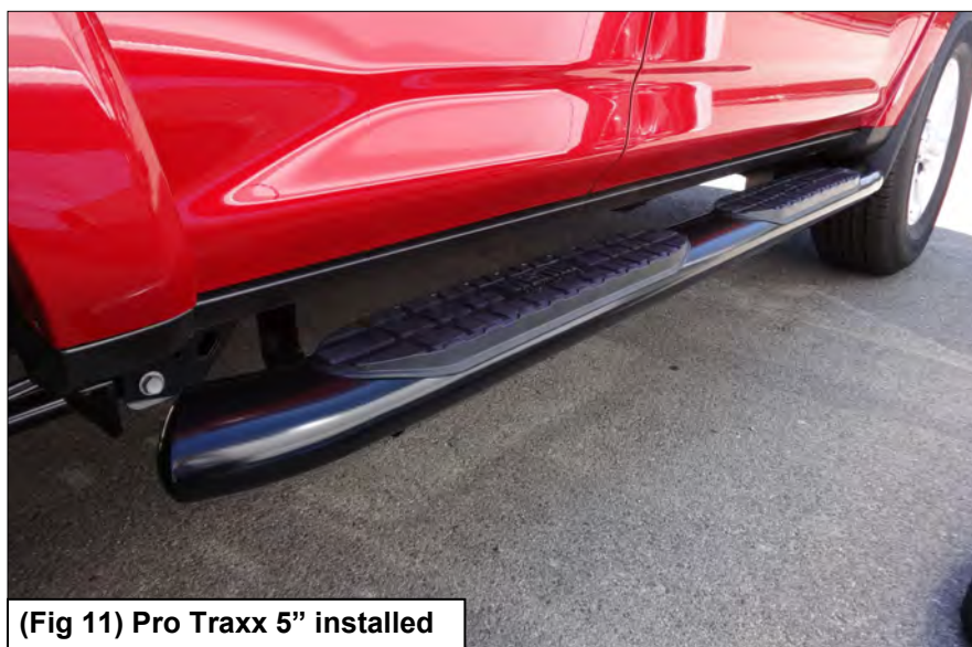
(Fig 11) Pro Traxx 5" installed