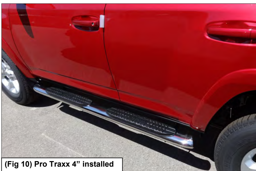
(Fig 10) Pro Traxx 4" installed