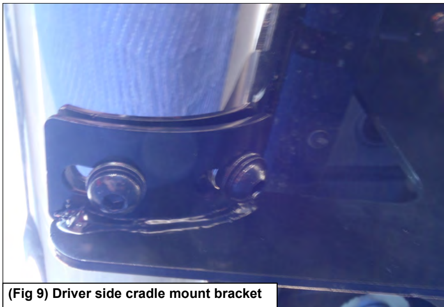
(Fig 9) Driver side cradle mount bracket