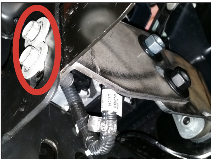
46647-8 Brackets Installed