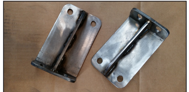
Front Brackets 46647-5 Diagram 3