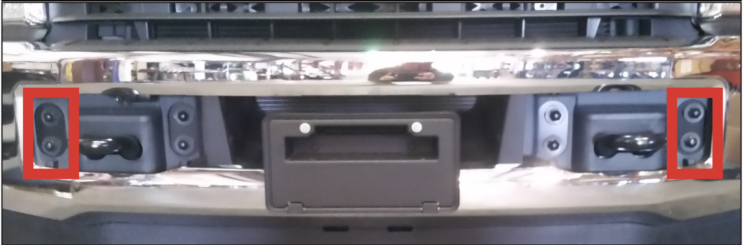
Front Bumper Mounting Bolts