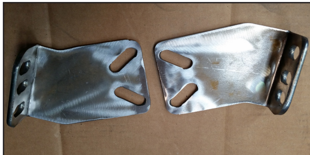
Side Brackets (46647-7 shown) Diagram 2