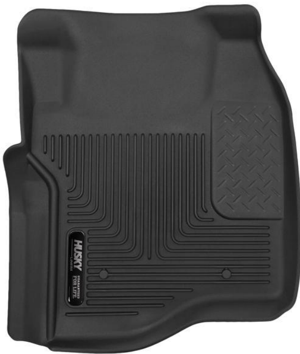
LEFT OR DRIVER

Your liners are made from an engineering resin that is lightweight and extremely tough and durable. The easiest way to clean your liners is with a damp cloth or sponge and soap and water. Windex®, 409® and ArmorAll® type cleaners work as well.