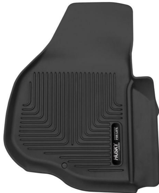
RIGHT OR PASSENGER

*Attention 2012 Super Duty owners: Ford added a foot rest in the upper left had corner of the driver's side floor board mid-year in 2012. Part #53301 is designed for applications without this foot rest. Please see the reverse side of this page for more information regarding this foot rest.