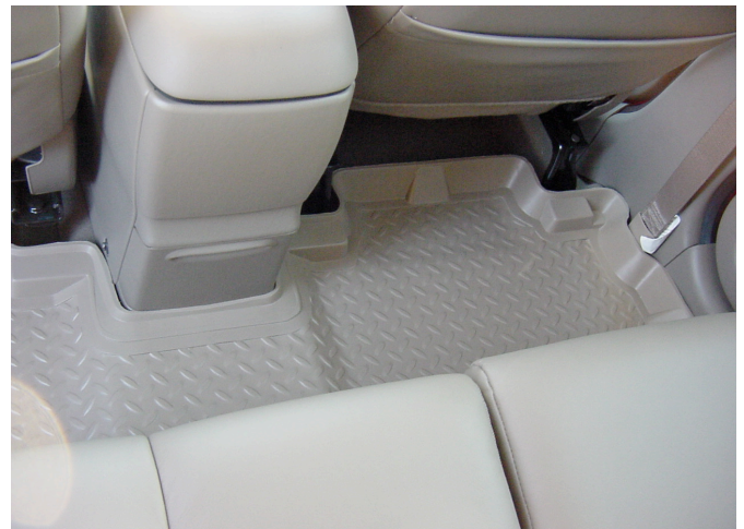
6317 SHOWN IN VEHICLE WITH THE LONG CONSOLE (UP TO 04')