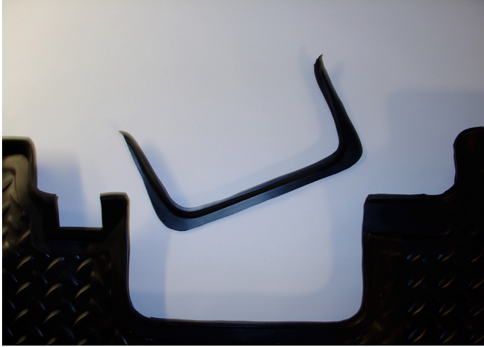
6317 SHOWN TRIMMED FOR USE WITH LONG CONSOLE (UP TO 04')