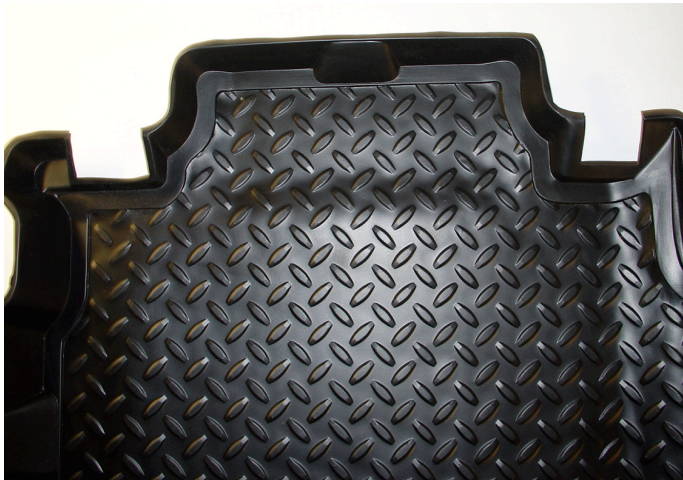
6317 SHOWN TRIMMED FOR USE WITH POWER SEAT EQUIPPED MODELS