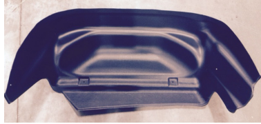
Wheel Well Guard Driver's Side (1)