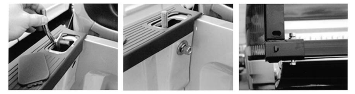
Place Backrack c/w Toolbox Brackets on to bed rail and secure to Stake Pocket Bolts.

Attach Toolbox Brackets to Backrack frame