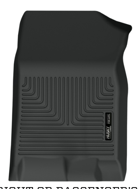
RIGHT OR PASSENGER'S

TO EASE INSTALLATION OF YOUR NEW FRONT LINERS, MOVE BOTH FRONT ROW SEATS TO THEIR MOST REARWARD POSITION. WITH THIS DONE, INSTALL THE LINERS AS SHOWN ABOVE. THE DRIVER SIDE LINER WILL ATTACH TO THE FACTORY FLOOR MAT RETAINING POSTS. ONCE YOU HAVE INSTALLED YOUR LINERS, REPOSITION THE SEATS AS DESIRED.