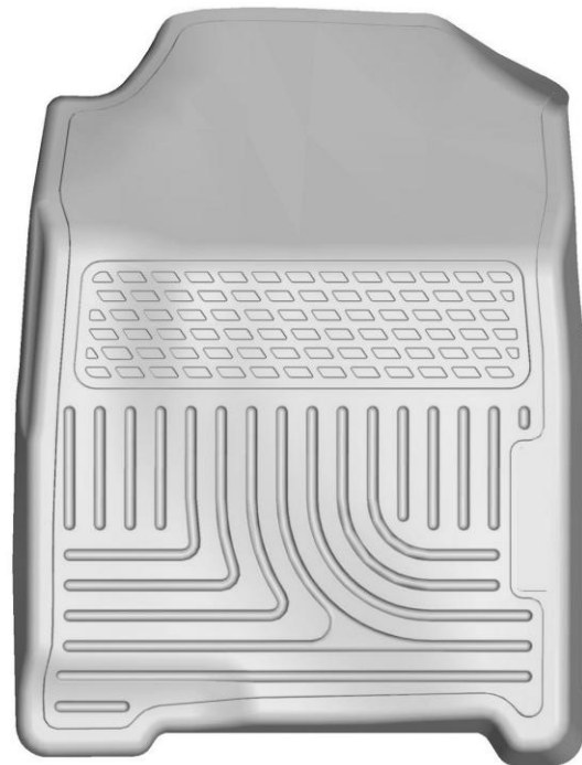
RIGHT OR PASSENEGER'S SIDE

TO EASE INSTALLATION OF YOUR CR-V FRONT FLOOR LINERS, FIRST SLIDE BOTH FRONT ROW SEATS ALL THE WAY BACK TO EXPOSE THE FRONT FLOOR PANS. ONCE YOU HAVE INSTALLED THE FRONT LINERS, REPOSITION THE FRONT SEATS AS DESIRED.