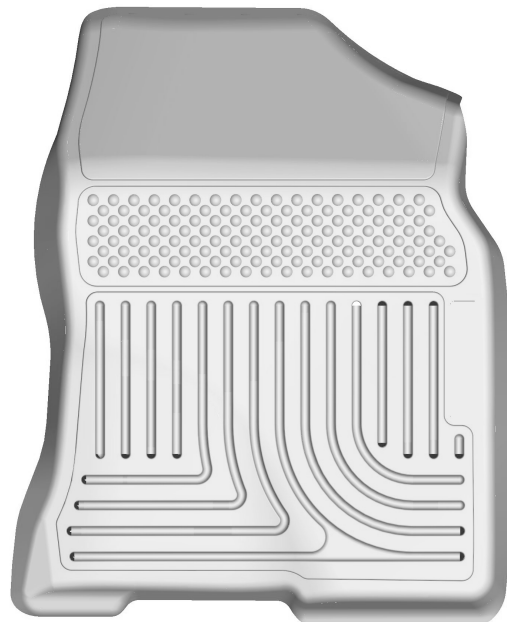
RIGHT OR PASSENGER'S SIDE

TO EASE INSTALLATION OF YOUR TOYOTA PRIUS FRONT FLOOR LINERS, MOVE THE FRONT SEATS TO THEIR REAR MOST POSITION. WITH THIS DONE, THE FACTORY CARPET HOOK(S) LOCATED IN THE CARPET OF THE DRIVER'S SIDE FLOOR CAN BE EASILY REMOVED. REMOVING THE HOOK(S) WILL ALLOW YOUR LINER TO LAY COMPLETELY FLAT. TO REMOVE THE HOOK(S), APPLY FIRM AND EVEN PRESSURE WHILE LIFTING THE END OF THE HOOK ARM STRAIGHT UP. ONCE THE HOOK(S) ARE REMOVED, INSTALL THE LINERS AND REPOSITION SEATS AS DESIRED.