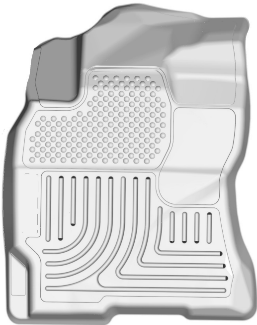
LEFT OR DRIVER'S SIDE