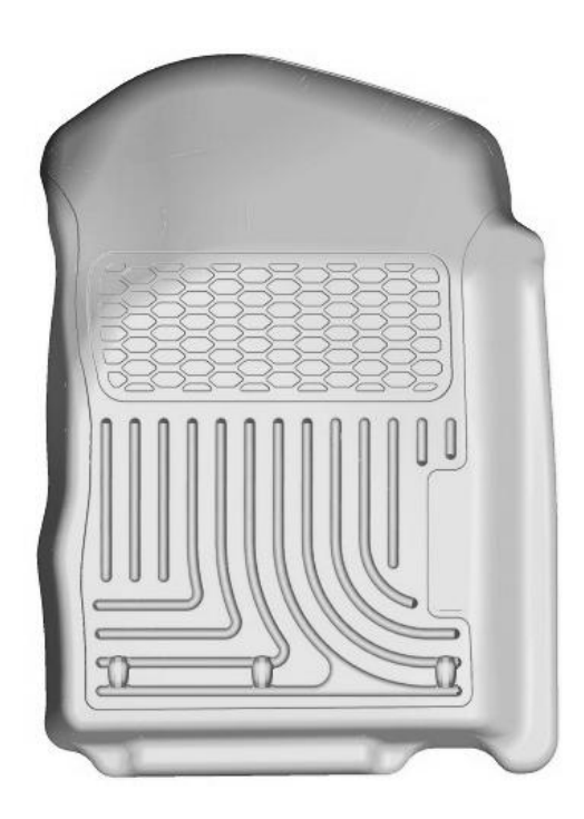
RIGHT OR PASSENGER'S SIDE

TO EASE INSTALLATION OF YOUR NEW DURANGO / GRAND CHEROKEE FRONT LINERS, FIRST MOVE BOTH OF THE FRONT ROW SEATS ALL THE WAY BACK SO AS TO ALLOW THE MOST LEG ROOM. ONCE YOU HAVE INSTALLED YOUR LINERS, REPOSITION THE FRONT SEATS AS DESIRED.