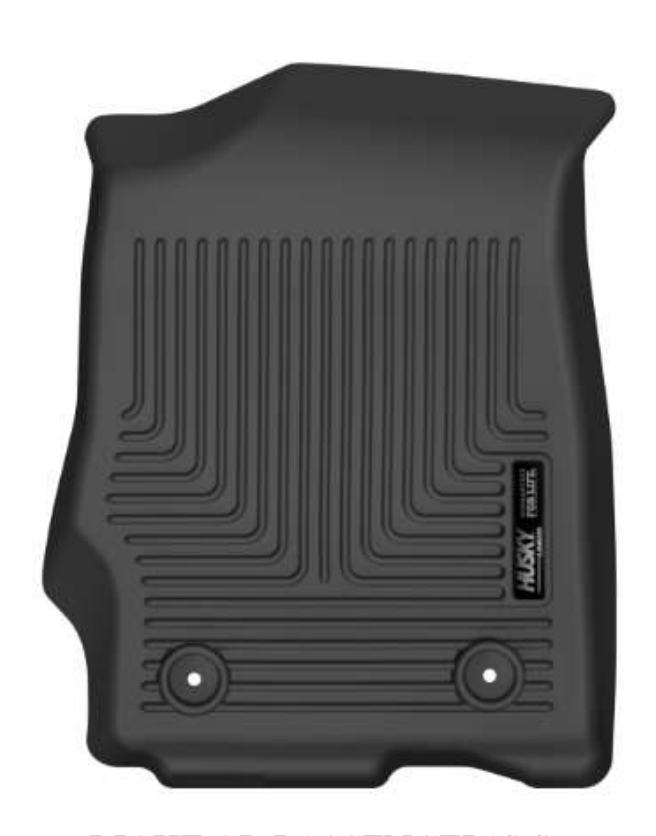
RIGHT OR PASSENGER'S SIDE

TO EASE INSTALLATION OF YOUR NEW FRONT LINERS, MOVE BOTH FRONT ROW SEATS TO THEIR MOST REARWARD POSITION. WITH THIS DONE, INSTALL THE LINERS AS SHOWN ABOVE. THE LINERS SNAP OVER / ATTACH TO THE FACTORY MAT RETAINERS. ONCE YOU HAVE INSTALLED YOUR LINERS, REPOSITION THE SEATS AS DESIRED.