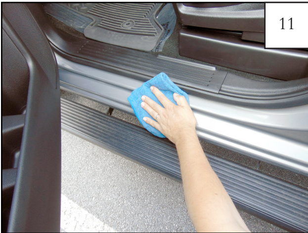
The Front Side Panel installs with the same preparation methods as the rear.