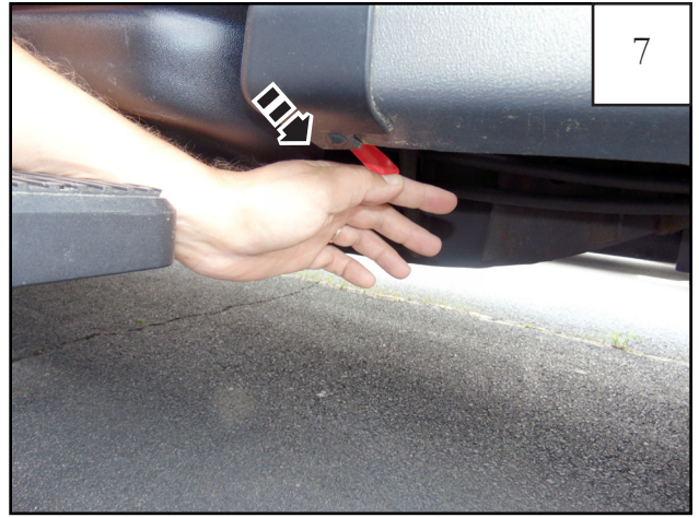
Pull tape liner tab 4.