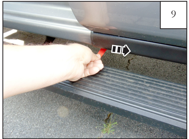
Pull tape liner tab 6. NOTE: It may be necessary to partially close door in order to access tab.