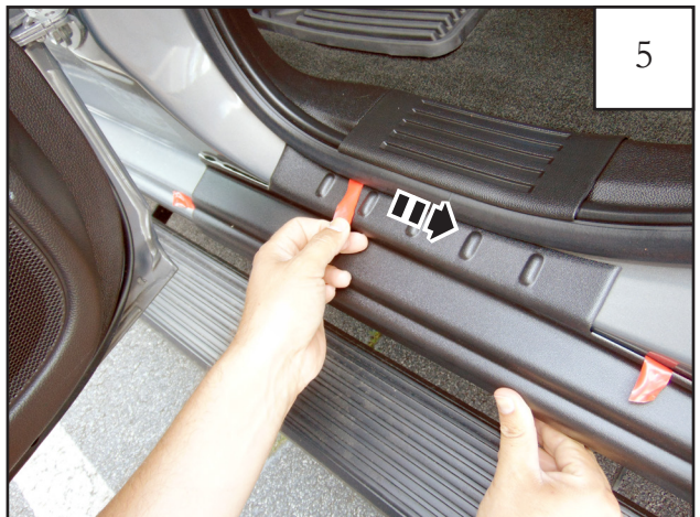
Pull tape liner tab 2.