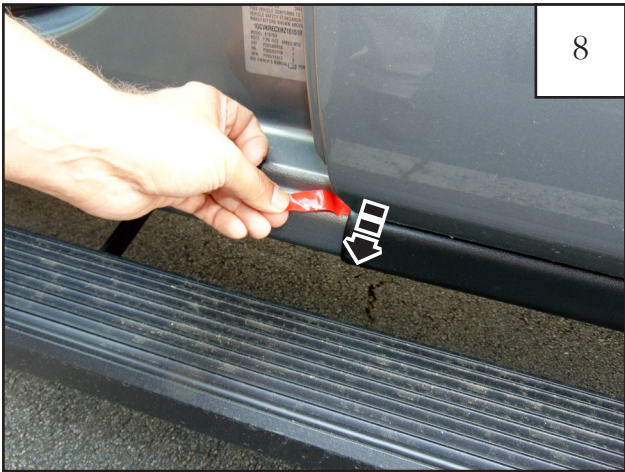
Pull tape liner tab 5. NOTE: It may be necessary to partially close door in order to access tab.