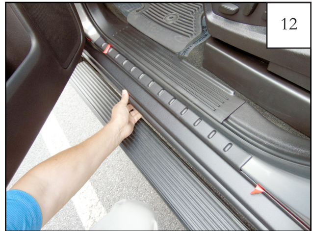
Place part on vehicle, making sure to line up edges of part with edges of vehicle. Ensure that all tape tabs are accessible. Firmly press on exposed areas of tape to tack Trail Armor in place. NOTE: Refer to step 10 for placement of certain tabs.