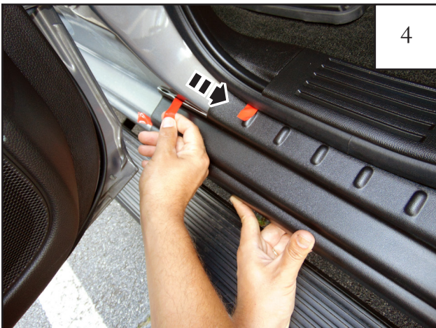
Pull tape liner tab 1.

Place part on vehicle, making sure to line up edges of part with edges of vehicle. Ensure that all tape tabs are accessible. Firmly press on exposed areas of tape to tack Trail Armor in place. NOTE: Refer to step 1 for placement of certain tabs.