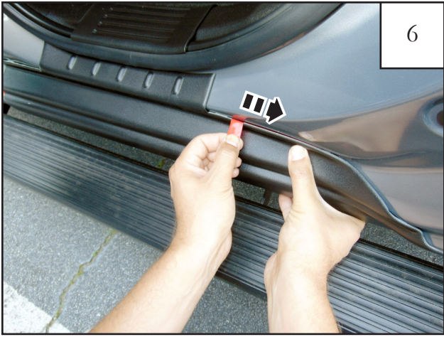
Pull tape liner tab 3.