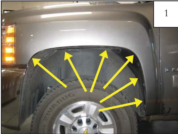
Remove six factory fasteners with a pry tool.