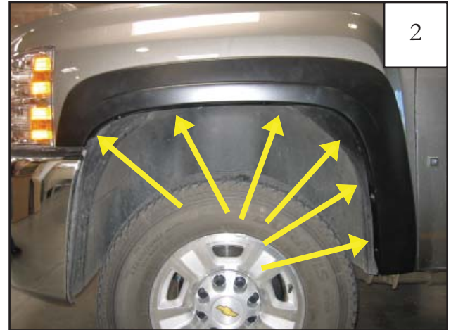
Install six tuflocks using a #2 stubby screwdriver.