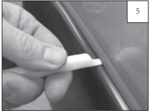
Using flat end of supplied Edge Trim Tool, seat edge trim against flare by inserting straight end between edge trim and flare at one end. Next, slide around entire edge to the other end.