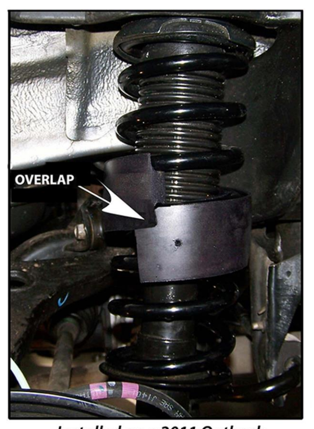
Installed on a 2011 Outback To complete installation install nylon wire ties

Refer to SumoSprings application guide for part selection www.supersprings.com [Tech line #866-898-0720] SumoSprings enhance load carrying capability, handling & towing. Never exceed vehicle manufacturer's GVWR rating.