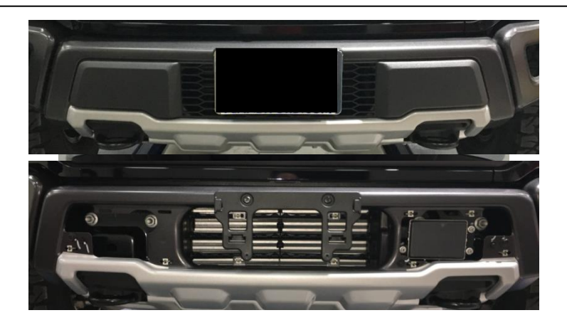
Step 2: Remove the outer nut that attaches the bumper to the frame (Both sides) .

Step 1: Using a panel popper or flat head screw driver, release all 16 retaining clips holding the center bumper cover. Pull out and away to remove from bumper, exposing the six factory bumper bolts.