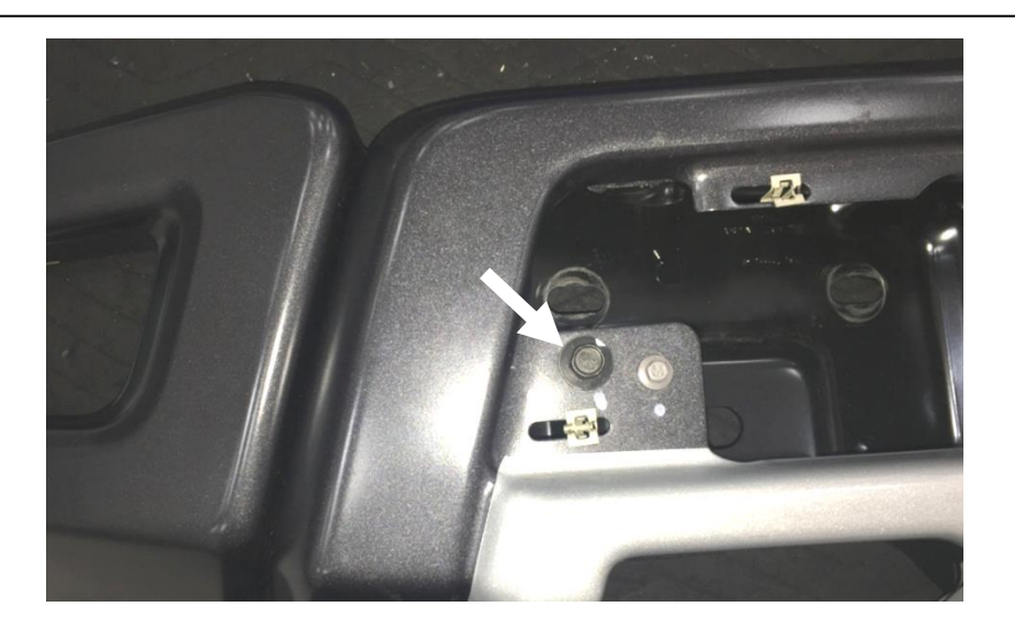
Step 3: Remove the outer bolt that attach the bumper end in the front. (Both sides)

<u>Step 4:</u> Install the two mounting brackets Using the \frac{3}{4} " factory nut removed from step 2 and the supplied \frac{3}{4} " x \frac{3}{4} " hex head flanged bolt and \frac{3}{4} " flanged nut. Tighten all hardware.