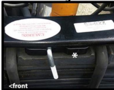
Place PSP-19 on top of spring plate flat side up facing, with groove toward the front