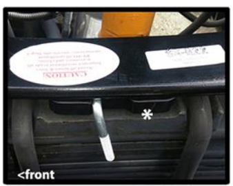
Place PSP11 on top of spring plate flat side up facing, with groove toward the front