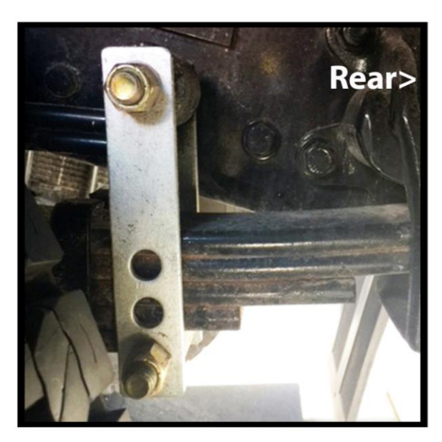
*Where chassis are equipped with top helper leaf the overload perches need to be unbolted and removed *

Refer to SuperSprings application guide for part selection www.supersprings.com [Tech line #866-898-0720] SuperSprings enhance load carrying capability, handling & towing. Never exceed vehicle manufacturer's GVWR rating.