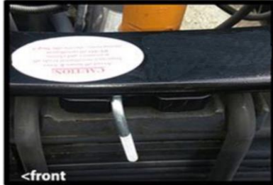
Place PSP-11 on top of spring plate flat side upwith groove toward the front