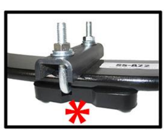
PSP11 with hold-down clamp assembly