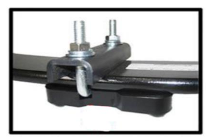
PSP-11 with lock-down clamp assembly