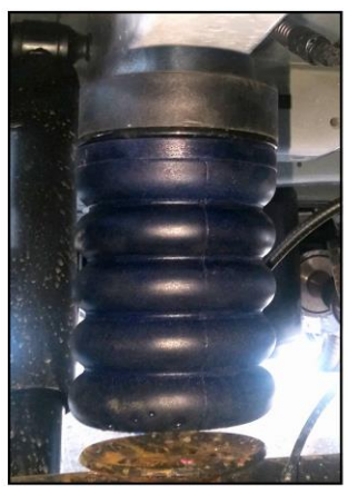
Depending on Transit configuration, use included spacers to achieve a .5" to 1" gap between bottom of Sumo and Axel Pad

Refer to SumoSprings application guide for part selection on www.supersprings.com [Tech line #866-898-0720] SumoSprings enhance load carrying capability, handling & towing. Never exceed vehicle manufacture's GVWR rating.