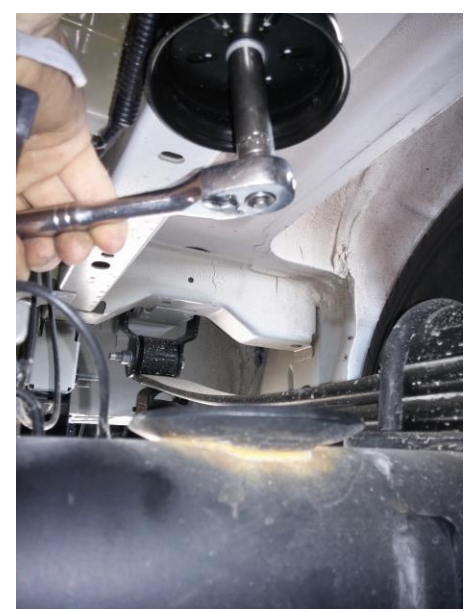
Fig. 1 Fig. 2