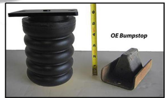
SSR-302-47 comparison to OE Bumpstop