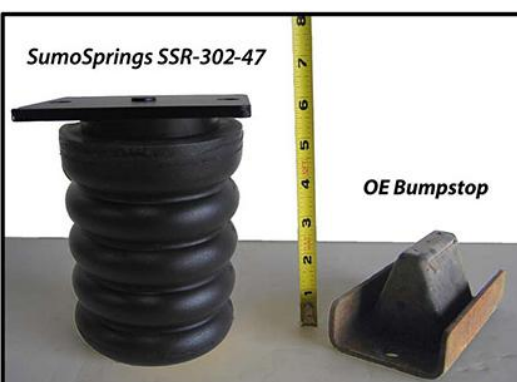
SSR-302-47 comparison to OE Bumpstop