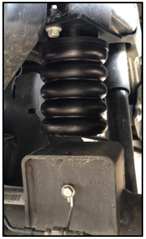
Rear SumoSprings SSR-302-47 installed

Refer to SumoSprings application guide for part selection www.supersprings.com [Tech line #866-898-0720] SumoSprings enhance load carrying capability, handling & towing. Never exceed vehicle manufacturer's GVWR rating.