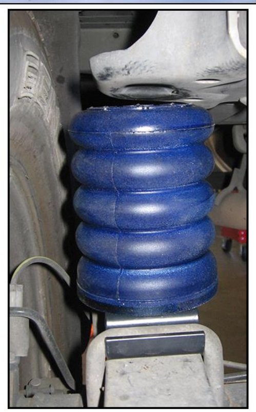
Typical SSR-610-40 Installation

Refer to SumoSprings application guide for part selection www.supersprings.com [Tech line #866-898-0720] SumoSprings enhance load carrying capability, handling & towing. Never exceed vehicle manufacturer's GVWR rating.