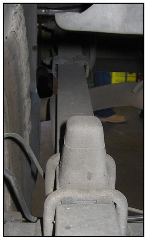
OE Tacoma ~ Tundra bumpstop