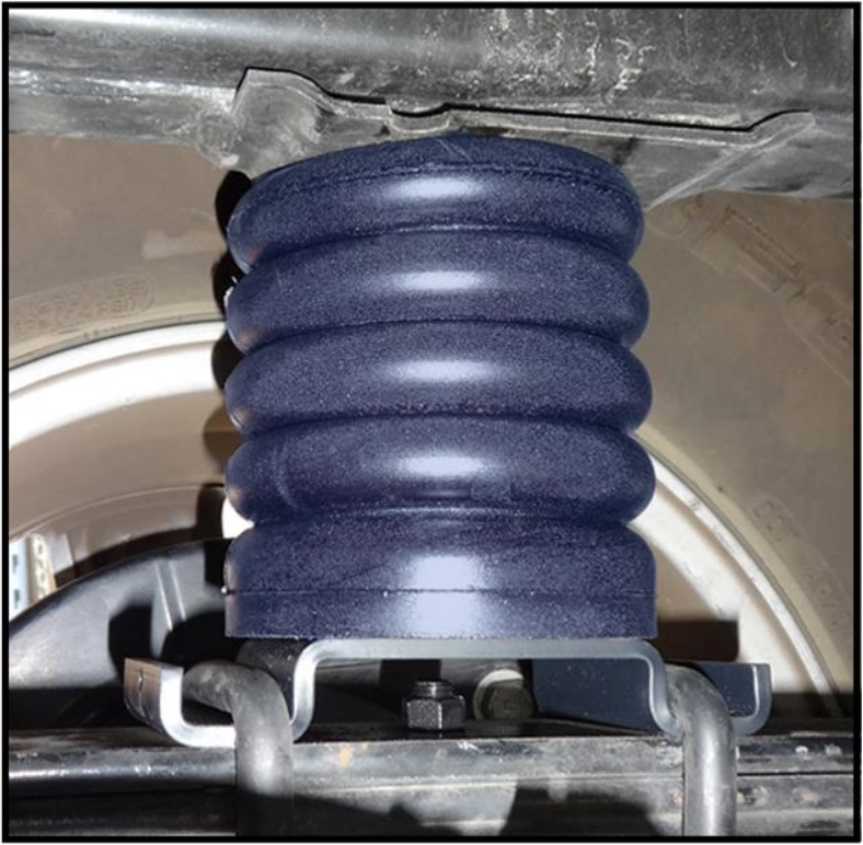
Typical SSR-610-40 Installation

Refer to SumoSprings application guide for part selection www.supersprings.com [Tech line #866-898-0720] SumoSprings enhance load carrying capability, handling & towing. Never exceed vehicle manufacturer's GVWR rating.