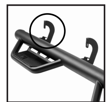
STEP 3: Insert spring loaded U nuts to the body of the truck.

Identify the driver and passenger bars. Drivers side has four one piece brackets and, passenger side front two brackets are two piece, the rear two are one piece.