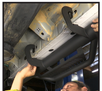
STEP 12 (Passenger Side): Carefully place passenger side step into place. Use bolt, washer and begin hand tightening both upper mountings and pinch weld mounting to the rear two brackets Best to have a assistant to lift and hold board in place.