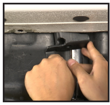
STEP 9 (Passenger Side): Take bracket and feed between the body and the DEF tank, feel and move until you locate the tab into the OE hole. The bracket will hang once placed correctly.