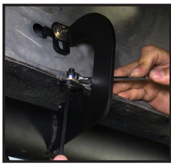
STEP 6 (Drivers Side): Avoid using power or air tools. Tighten pinch weld mounts first then upper bolts. Tighten to 20ft lbs torque to secure the board to the truck.