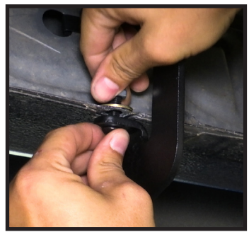
STEP 5 (Drivers Side): Insert black head bolt and washer through pinch weld hole and secure with locking nut and washer.