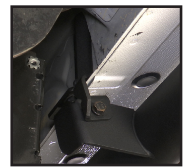
STEP 13 (Passenger Side): Use 13mm bolt to align 2 piece bracket to the board, insert at the sideand hand tighten. Apply to both first and second bracket.