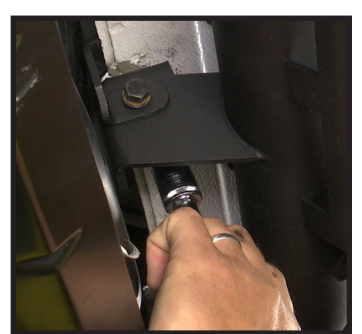
STEP 14 (Passenger Side): Insert bolt and washer going up through board, truck pinch weld and through the 2 piece bracket.