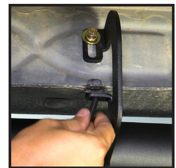
STEP 4 (Drivers Side): Carefully place HS2 step into place. Use bolt, washer and begin hand tightening all 4 upper mountings. Best to have a assistant to lift and hold board in place.