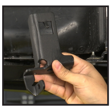
STEP 8 (Passenger Side): First bracket has a tab that locates in the OE body mount hole.