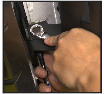
STEP 15 (Passenger Side): Snug hardware for the first and second bracket. Tighten the bolt going up throught the pinch weld first to pull the board into place. Then tightening both side bolts.

STEP 10 (Passenger Side): The second bracket attaches to the body with a bolt rather than the tab like the first bracket.