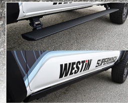
Pro-e Power Running Boards shown open and closed