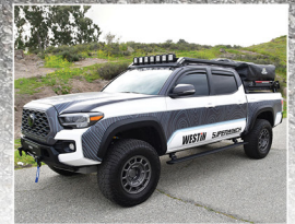
Pro-e Power Running Boards shown on Toyota Tacoma

VALID PROMO PERIOD JAN 1 ST - JULY 31 ST , 2025