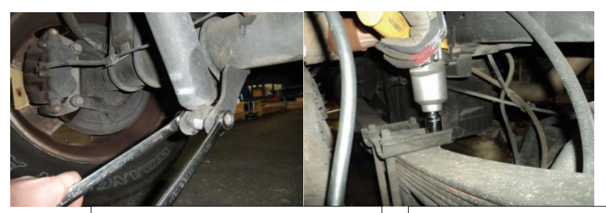
Remove the lower shock mount hardware.

Remove U-bolt nuts on top of spring pack.