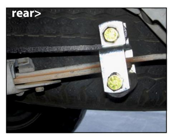
Square shackle to the rear

Refer to SuperSprings application guide for part selection www.supersprings.com [Tech line #866-898-0720] SuperSprings enhance load carrying capability, handling & towing. Never exceed vehicle manufacturer's GVWR rating.