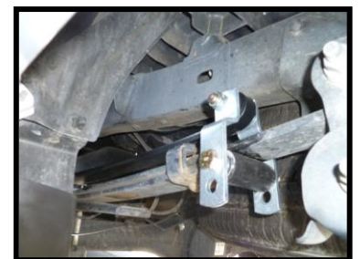
Fig. 3 - Rear

Use C-Clamp and pull down rear shackle Use UPPER (top) shack bolt-hole position. This provides additional vertical clearance to frame. Install polypropylene and steel roller assemblies and snug tighten nuts. Eye bolts of all shackles are set at factory. Do not tighten. Refer Fig. 3