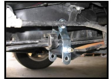
Fig. 2 - Front

Ensure all brake cables are routed clear out of the way of the SuperSprings blades; slight repositioning or the addition of a tie-wrap will often suffice. Select either the UPPER or LOWER bolt-hole position based on how much spring preload is desired. Note – using the UPPER hole will increase preload and vehicle ride height. Ensure that polypropylene (black) and steel rollers are reassembled in the shackle. Attach bolt on front shackle with threads facing OUT. Be sure to position upper bolt with bolt head outward and thread inward to ensure no damage to emergency brake line. Refer Fig. 2