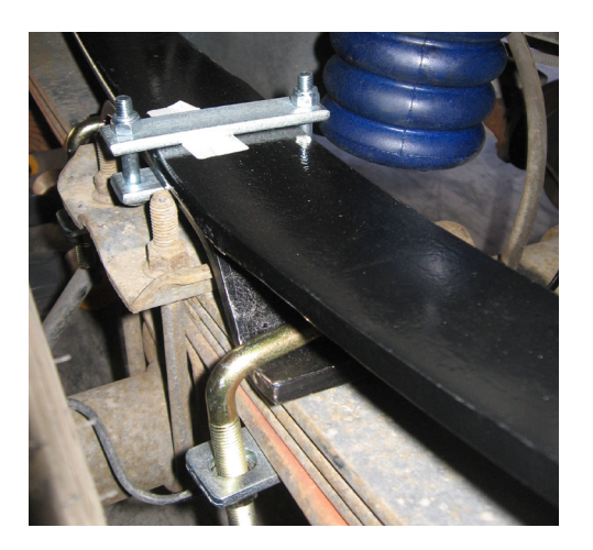
SuperSprings are installed on top of MTKT mounting kit.

Mounting Kit MTKT required (sold separately)