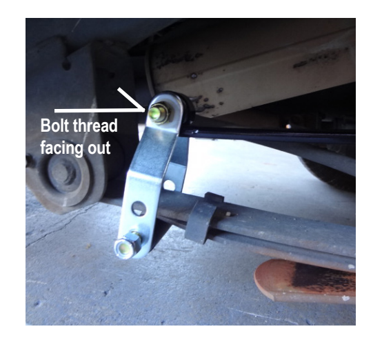
Ensure bolt heads attached to the SuperSprings are facing towards the center of the vehicle and bolt threads are facing out.

SuperSprings are installed on top of axle.