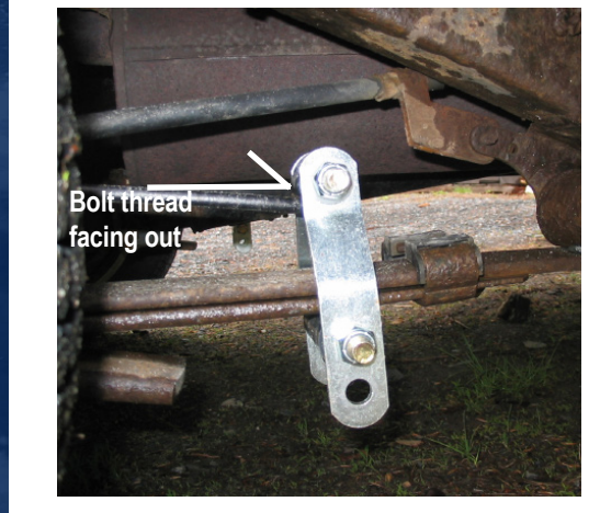
Front Use upper bolt hole position on the front shackle to ensure frame clearance.

SuperSprings® are a unique and patented self-adjusting suspension stabilizing system for vehicles with rear leaf springs, designed to level loads and reduce body roll. SuperSprings® provide users extra load support and reduce body roll without compromising ride quality. They are manufactured using a variety of different sized springs to support multiple applications. All SuperSprings® are manufactured in the U.S.A. from SAE5160H high grade, shot peened steel.