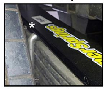
Spring mounted on PSP