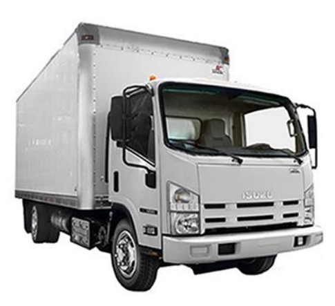
Install PSP pad with flat side up