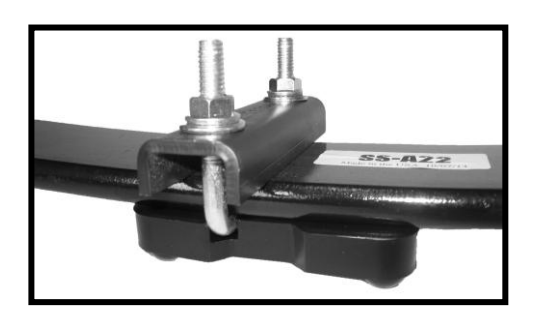
Polyurethane Mounting Kit Assembly