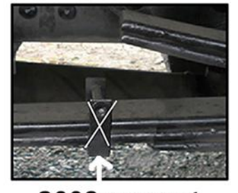
2008-present Completely remove front OE spring clip. Rivet on under side of spring needs to be ground flush to the spring. Only remove front clip