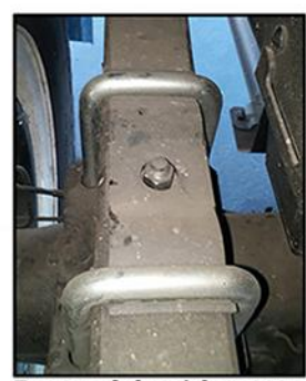
For models with center bolt as shown above, no modification to the PSP pad is required.