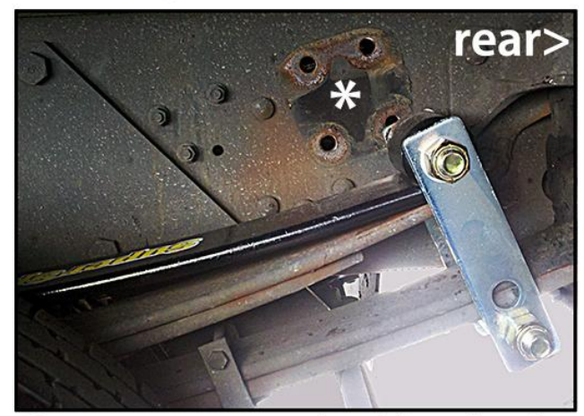
Remove rear overload bracket *

Refer to SuperSprings application guide for part selection www.supersprings.com [Tech line #866-898-0720] SuperSprings enhance load carrying capability, handling & towing. Never exceed vehicle manufacturer's GVWR rating.