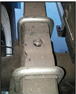
For models with center bolt as shown above, no modification to the PSP pad is required.