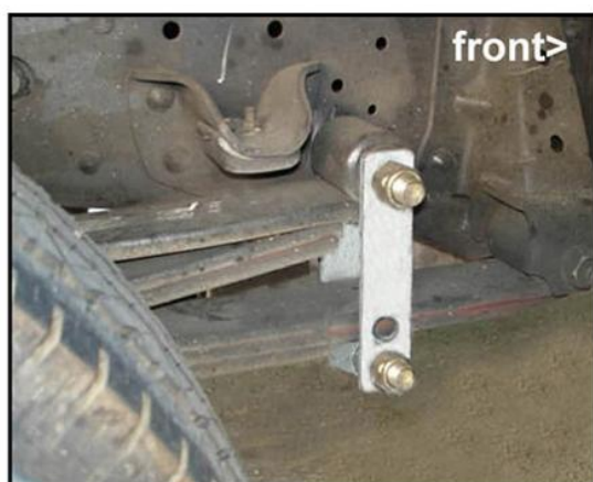
2008 & newer vehicles require removal of front factory clip

Refer to SuperSprings application guide for part selection www.supersprings.com [Tech line #866-898-0720] SuperSprings enhance load carrying capability, handling & towing. Never exceed vehicle manufacturer's GVWR rating.