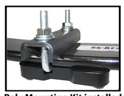
Poly Mounting Kit installed