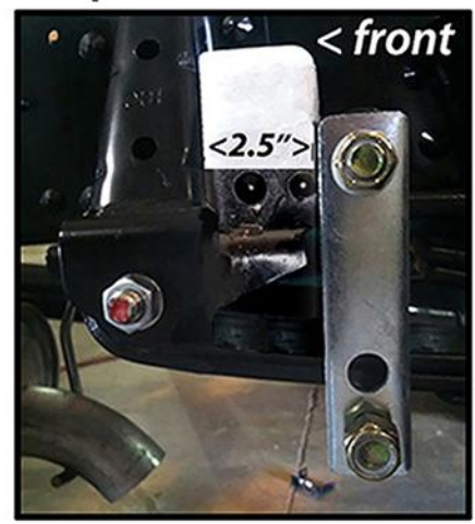
Spring mounted front shackle