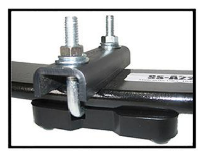
Poly Mounting Kit installed