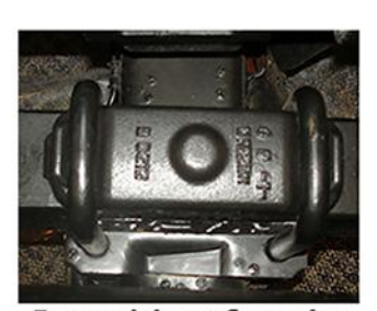
For models configured as shown above, trim flush center bump portion of PSP as shown below.