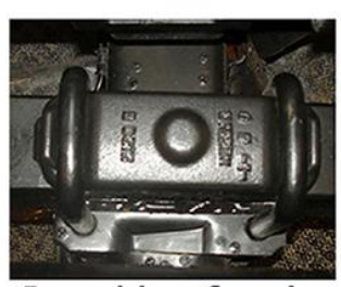
For models configured as shown above, trim flush center bump portion of PSP as shown below.