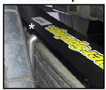
Spring mounted on PSP