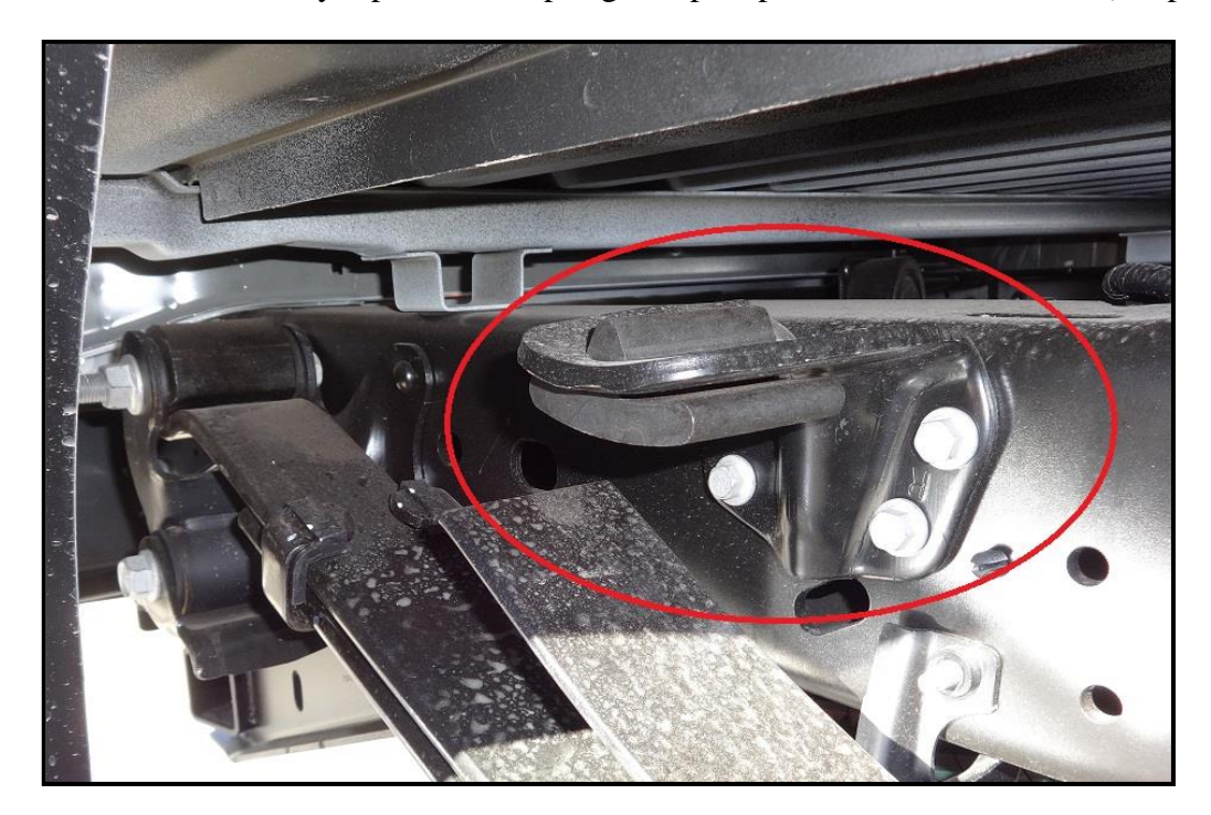
<u>Step 4:</u> Place PSP-7 on top of factory spring plate so that it locates on center bolt and spring pad as shown. Place lockdown kit u-bolt on TOP of the PSP-7 between the center and forward bumps. Slip SuperSpring through wheel well or slide in from behind vehicle, positioning it on top of the PSP-7. Position lockdown kit u-bolt with the threads pointing up, install the clamp and thread nuts lightly onto u-bolt. (see pictures below)

Step 3: Remove the rear factory top overload spring bump stop bracket on both sides. (see picture below)