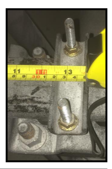
Step 4: Position the shackle on the front of the SuperSpring so that it is directly behind the sway bar link. (see picture at right). Ensure head of upper shackle bolt is clear of sway bar link! Using a heavy duty C-clamp or Supersprings installation tool pull the front shackle legs down around the factory leaf springs and install the steel sleeve, roller, and bolt. Tighten roller bolts and nuts hand tight so hardware is snug. Ensure all A/C lines and brake cables are clear of interference. Where additional lift or more vertical clearance is required, use one of the shackle upper bolt hole positions. In other cases, use the shackle lower bolt hole position.