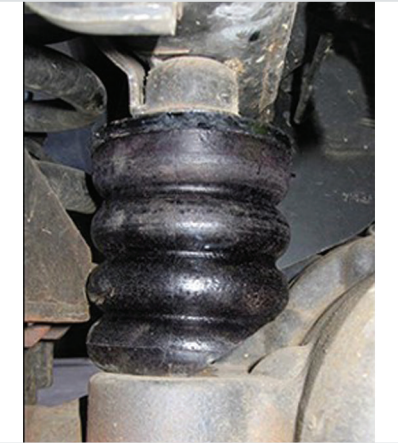
Drivers Side Installed - The notched SumoSprings is installed on the drivers side *SumoSprings Black -47 used in photo