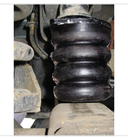
Passengers Side Installed *SumoSprings Black -47 used in photo

PART NUMBER: SSF-302-40 PRODUCT LINE: SumoSprings VER:20190610