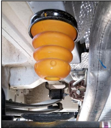
O.E.M. Bump Stop

Ford Transit 150 | 250 | 350 [2015 - Present] SuperSprings Part# SSR-121-40/47/54