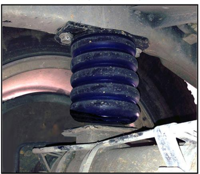
Colorado~Canyon Z71 with SSR-210-40 installed

Refer to SumoSprings application guide for part selection www.supersprings.com [Tech line #866-898-0720] SumoSprings enhance load carrying capability, handling & towing. Never exceed vehicle manufacturer's GVWR rating.