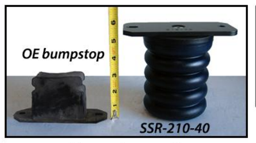
Xterra bumpstop compared to the SSR-210-40