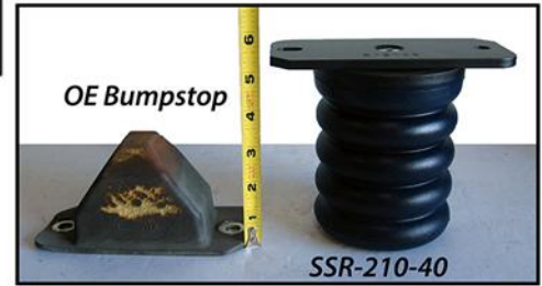
Colorado~ Canyon bumpstop comparison