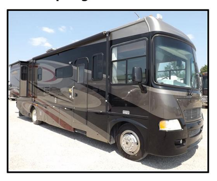
SSR-502-54 Replaces OEM Bumpstop

Suspension Enhancement Freightliner Motor Home FRED 22 K~27K GVWR [2007 ~ 2009] SumoSprings Part# SSR-502-54