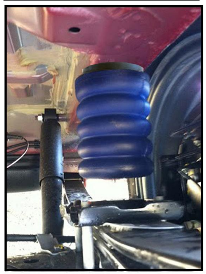
SumoSprings SSR-601-40 Installed

Refer to SumoSprings application guide for part selection www.supersprings.com [Tech line #866-898-0720] SumoSprings enhance load carrying capability, handling & towing. Never exceed vehicle manufacturer's GVWR rating.