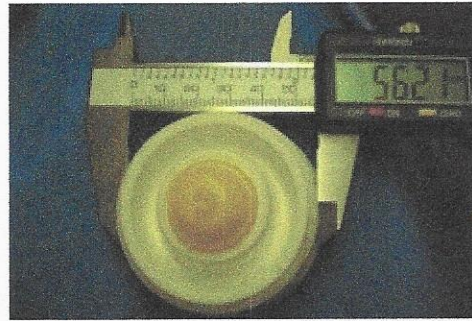
This bung measures close to 55mm.

Both these drums require an Ezi-action® M55 fitting.