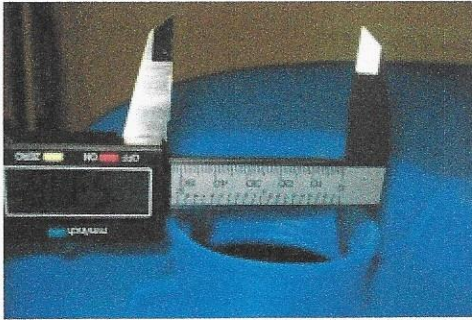
This opening measures close to 55mm.