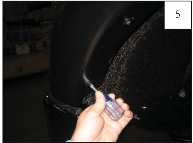
Using a #2 Phillips Screwdriver, install two supplied Tufloks (RV1-P001) through additional holes in flare and into fender. NOTE: Use a push-twist motion.