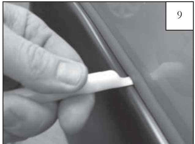
Using flat end of supplied Edge Trim Tool (ET1-0002), seat edge trim against flare by inserting straight end between edge trim and flare at one end. Next, slide around entire edge to the other end.