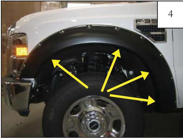
Remove four factory screws with a 7/32" socket wrench. Save screws for reinstallation.