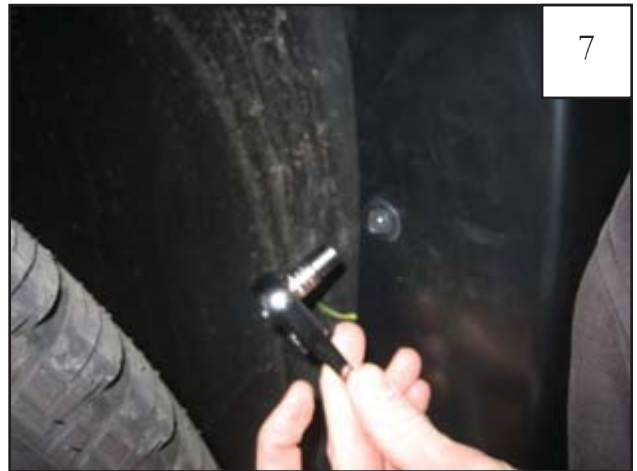
Holding flare in position on fender, reinstall factory screws removed in Step 4.