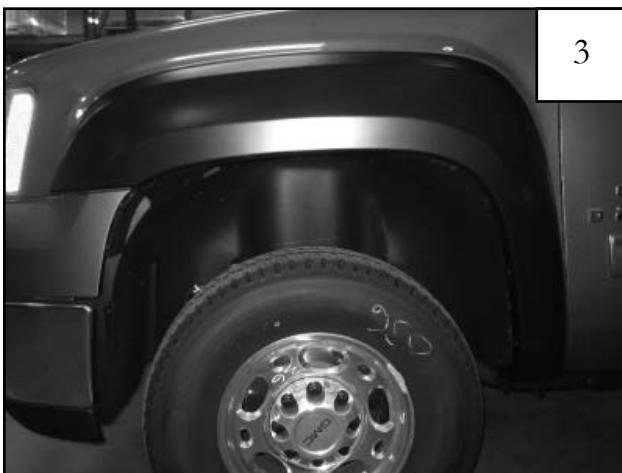
Verify fit and tighten all screws.