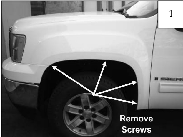
Using a 7mm socket, remove four factory screws. Retain screws for later use.