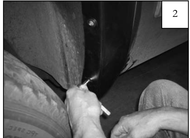
Position flare on fender, and reinstall four factory screws removed in Step 1. If needed, use an awl to locate holes.